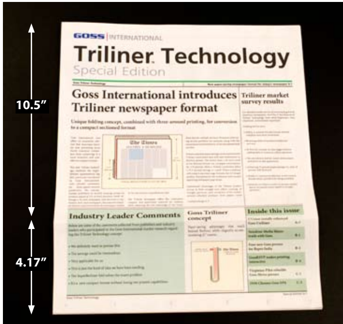
Sample product: 22" cutoff press

Triliner™ technology converts two-pages-around newspaper presses to print three pages around, allowing publishers to save paper, increase productivity and color capacity, maintain broadsheet advantages and accommodate standard-size advertising inserts. Plate cylinders are modified to accept single plates around the entire circumference. A Goss folder delivers off-center folds, and straight-forward modifications to Goss mailrooms allows postpress systems to process the smaller, asymmetrically folded papers. Equipping a press with two folders provides the versatility to produce both two-around and three-around products by varying the number of pages imaged onto the single-around plates.